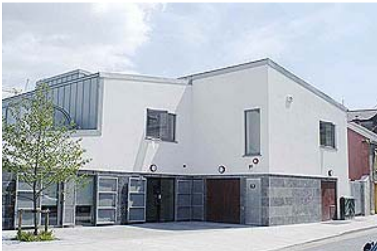
New Archives Building, Blackpool, Cork

The new building is a huge opportunity for C.C.C.A. to improve and expand the quality and extent of its services, both to the public and to local authorities. The new building will have enough space to store new archives for the foreseeable future. The site of the new archives also has enough space to allow for future expansion of our storage area in a future phase II.