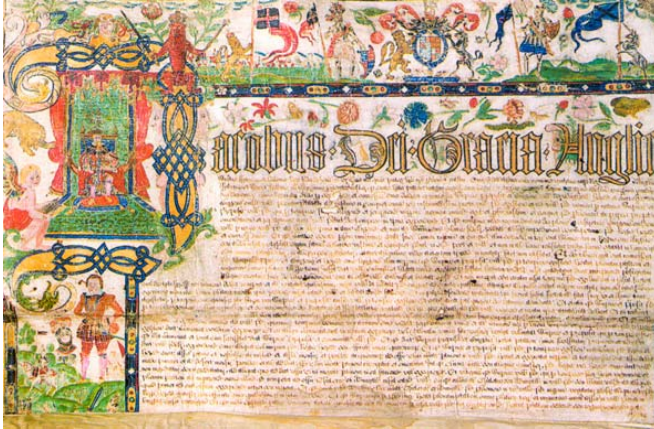
Youghal Charter (1609)